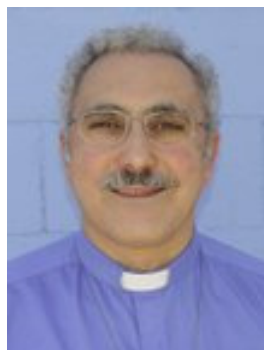
Table Talk Bible Study Topic: "The Muslim Challenge and Opportunity!"