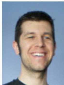
Table Talk Bible Study Topic: "Eschatology"